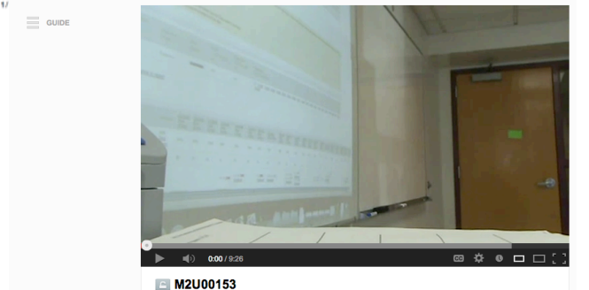
Figure 3: Video of homework review for experimental condition. To watch the full video, go to: http://www.youtube.com/watch?feature=player_embedded&v=Jb6Szy4fZ2w

An observational analysis of the video recordings of the teacher reviewing the homework revealed that while the time spent in the WBH condition was often longer than the TH, it was also far more focused than in the TH. Specifically, when students were in the TH condition, on average 1 minute passed before any meaningful discussion took place. Whereas, when students were in the WBH condition, homework review began immediately with the teacher reviewing what she perceived to be the most important learning opportunities!