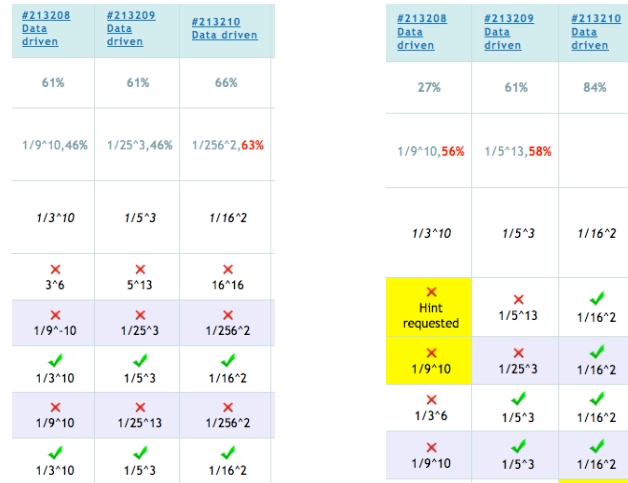
Figure 1: The item report for the control condition (on the left) and experimental condition (on the right) for triplet 1, showing the percent of students answering each question correctly, common wrong answers, the correct answer and several rows of student data.

requested was 4 was a standard deviation of 3.5. This suggests that students in the WBH condition took advantage of the ability to try questions multiple times to learn the material without requesting the correct answer.