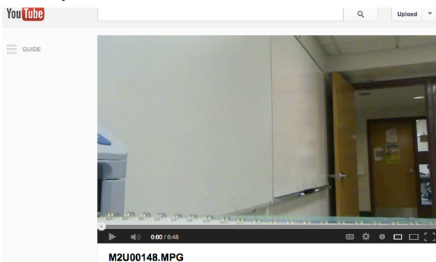
Figure 4: Video of homework review for the control condition. To watch the video go to: http://www.youtube.com/watch?feature=player_embedded&v=tBhcuCnKVCY

Other notable differences in the type of review include the number of questions answered. In the TH condition, 2 classes saw 3 questions each and one saw 7. However, in the WBH condition each class saw 4 targeted questions and 2 classes requested 1 additional question. The variation in question types also is important to note. The teacher was able to ensure that a variety of question types and mistakes were addressed whereas in the TH condition students tended to ask the same types of questions or even the same exact question that was already reviewed. Additionally, students in the TH condition also asked more general questions like “I think I may have gotten some of the multiplying ones wrong.” In one TH condition only multiplication questions were addressed when clearly division was also a weakness and similarly, another TH condition only asked questions about division. This accounts for much of the variability in overall review time.